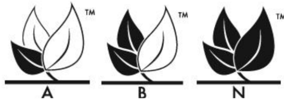
Figure 1. “Leaf Mark” Brake Pad Copper Content Box Markings

Source: The LeafMark is a trademark of The Motor and Equipment Manufacturers Association.